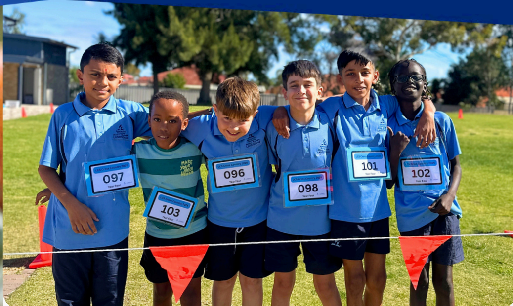
Cross Country 2025