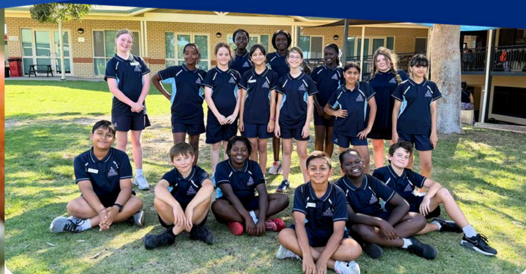
The Year 6 class proudly sporting their new leavers shirts.