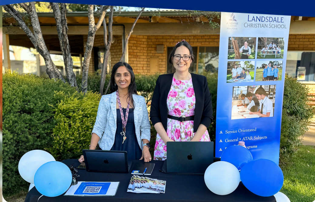
Open Night 2025