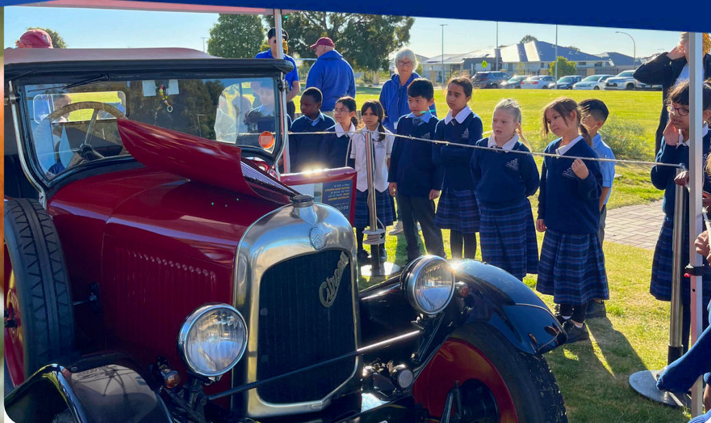
Students viewing 'Bubsie', the first car to travel around Australia.